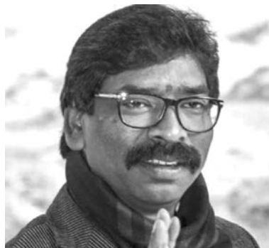
Hemant Soren, CM of Jharkhand

They say, "Truth will finally prevail"...but how long is it going to take... and how much damage is